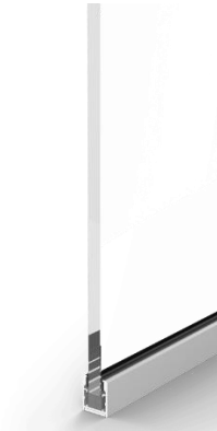
Figure 1 FG 12.76 mm, 17.52 mm, and 21.52 mm