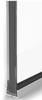
Figure 2 FG 42.76 mm