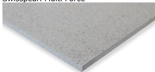
Swisspearl Multi Force