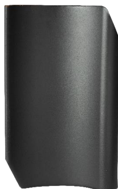
RT 840 (Engobed tile)