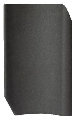
RT 810 (Damped tile)