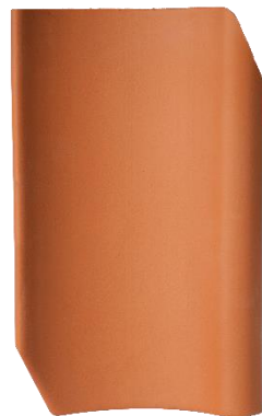
RT 806 (red tile)

Product illustrations: The illustrated products below are examples of products covered by this EPD. The EPD covers the mentioned products sold as part of the "GREENER" production line.