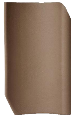
RT 807 (Brown tile)