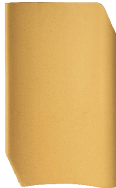
RT 811 (Yellow tile)